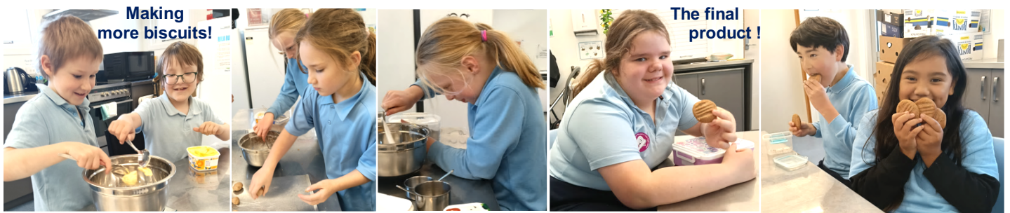
Making more biscuits!