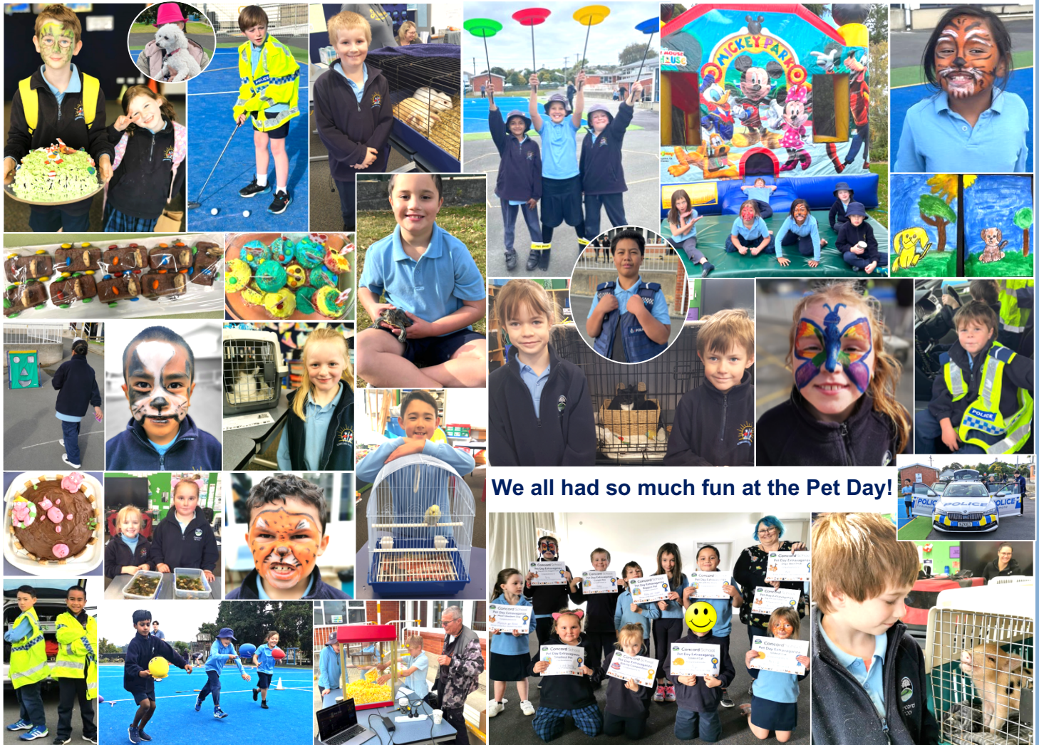
We all had so much fun at the Pet Day!