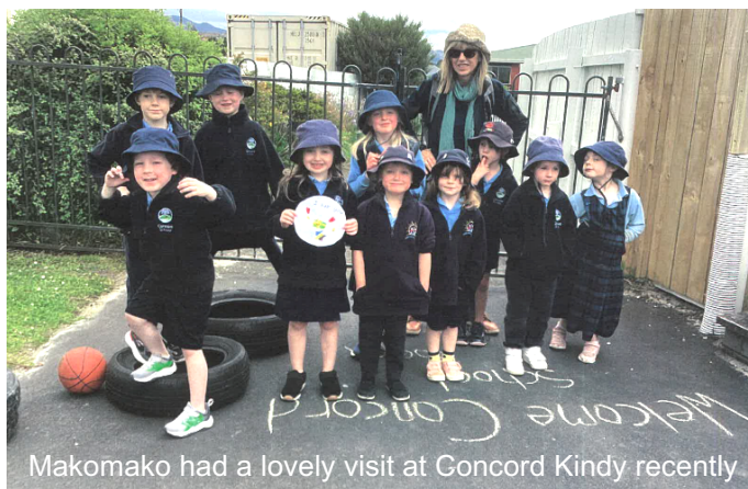
Makomako had a lovely visit at Concord Kindy recently

Art – This term all classes are learning about a different well-known artist. Kōwhai students are studying Vincent Van Gogh, his life and his masterpieces. We have spent some time on the excellent Vincent Van Gogh museum website ( https://www.vangoghmuseum.nl/en ) which is an excellent resource and well worth checking out.