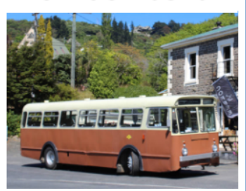
Heritage Bus Christmas Lights Tours

Don't miss a fun-filled weekend of Christmas festivities at Tūhura Otago