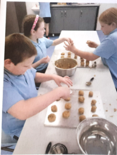
Biscuit making, teamwork and baking.

Concord School students and teachers alike are raving about the new learning space officially opened on Friday, 25th of May. A five year project to turn an unused storage room into a high quality learning space has just been completed along with major renovations to the satellite Sara Cohen block at the School.