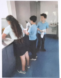
A group of students learning essential skills.

Everything that is cooked is shared with others. "It provides a real world hands-on space to