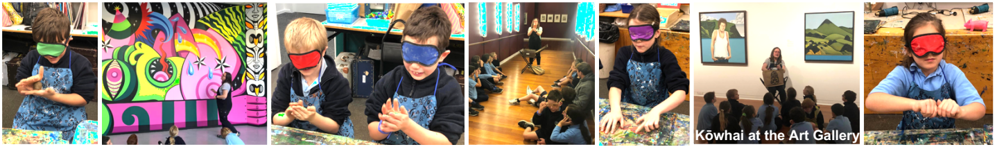
Kōwhiri at the Art Gallery