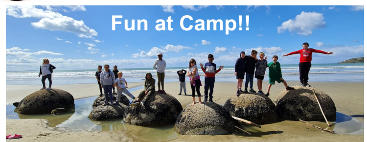
Fun at Camp!!